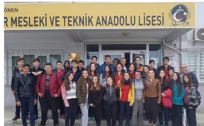
MİRÇİLER MESLEKİ -TURKEY