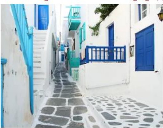
ALTERA VITA CYCLADES